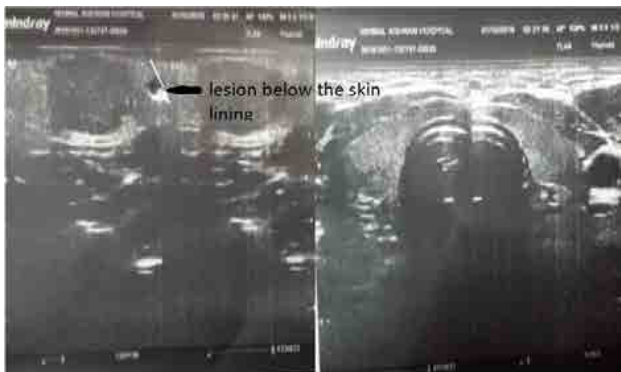
Fig. 1. USG of the swelling

Histopathology report showed irregular islands of epithelial cells in a characteristic organization with a bi-