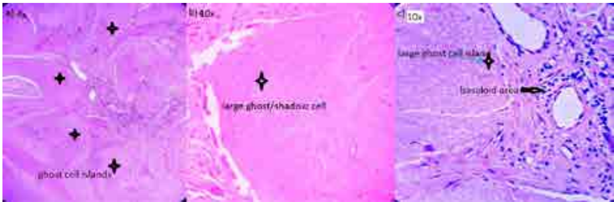
Fig. 4. Histopathology report – fig 4a highlights the islands of ghost cells at 4× magnification, fig 4b shows an enlarged ghost cell at 40× magnification and fig 4c image represents the basaloid cell area along with large ghost cell island at 10× magnification (H&E stain)

the cheeks followed by periorbital and preauricular regions. 4,8,11 About 90–98% lesions reported in literature are found to be solitary lesions similar to our case with isolated lesion in right parotid region whereas 2–10% have been reported as multiple tumor lesions in the same individuals. 4,9,11