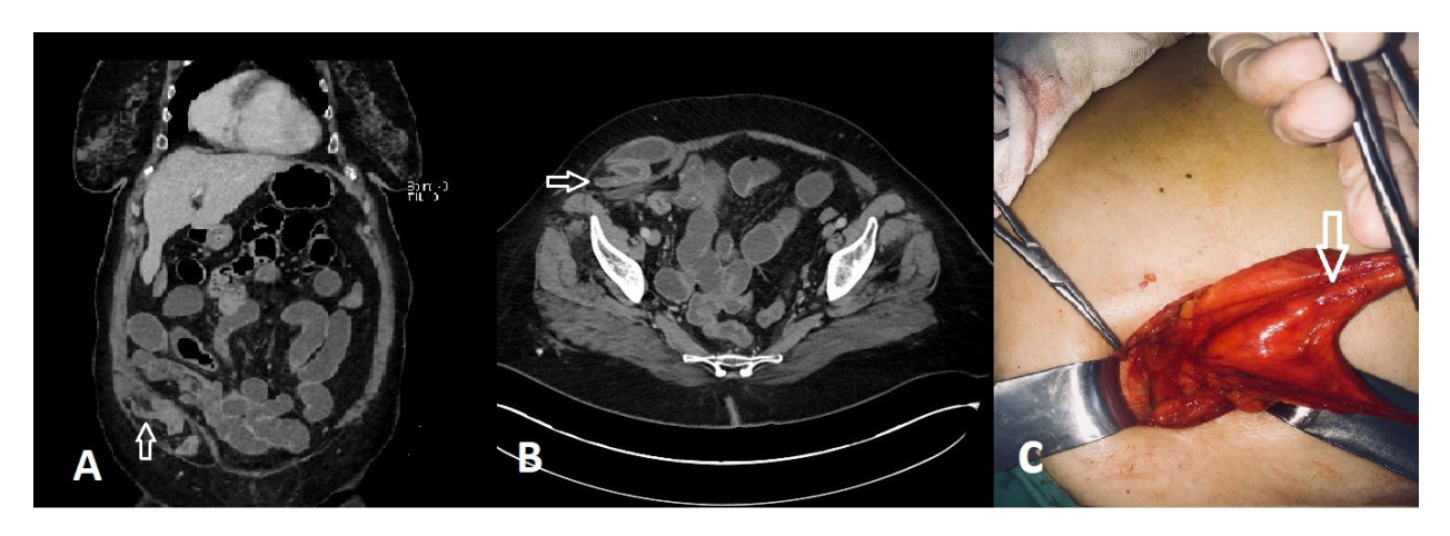
Fig. 1. The coronal CT (A) and axial CT (B). The arrows indicate the insert within the SH sac. Peroperative appendix and mesoapandix (C). The marked arrow shows the appendix inside the opened hernia sac

SH is a lateral ventral hernia or also called semilunar line hernia . SH arises from the weak area in the Spielian fascia between the rectus muscle and the internal and transverse oblique muscles. Increased intra-abdominal pressure, abdominal wall trauma, and weakening of the fascial layers with age are the reasons included in the etiology.<sup>1,3</sup> Obesity, chronic obstructive pulmonary disease, diabetes, coronary artery disease and peripheral vascular diseases are the most common comorbidities. In addition, 50% of these patients have a history of abdominal surgery.<sup>4</sup> Omentum (39.1%), small intestine (33.7%) and colon (13.5%) are frequently located in the hernial sac. Rarely, the stomach, gallbladder, ovary and appendix can be located in the hernia.4 Clinical findings may differ according to the structures in the hernia. Patients can usually apply only with pain without palpable swelling, and this makes diagnosis difficult.5 Our patient also presented with a non-specific abdominal pain without swelling as stated in the literatüre. Ultrasound (US) and CT help in diagnosis. In the series of 81 cases by Larson et al., 74%