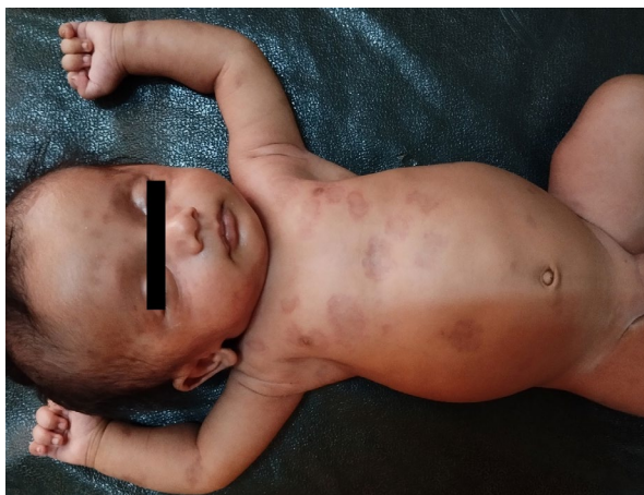
Fig. 1. Erythematous macules and annular plaques distributed on the face, trunk and extremities

Examination of the infant revealed multiple erythematous to hyperpigmented macules and annular plaques distributed bilaterally on the face, trunk and extremities (Fig. 1). The facial lesions involved the forehead and periorbital areas. Mucosal involvement was absent and no abnormality was detected on systemic evaluation.