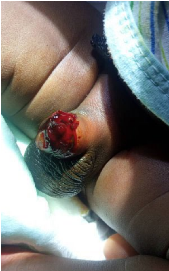
Fig. 1. Bleeding from plastibell circumcision