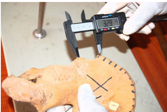
Fig. 7. Measuring the distance between the ASIS and AIIS