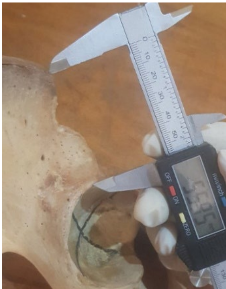
Fig. 6. Measuring the distance between the ASIS and nearest edge of the acetabulum