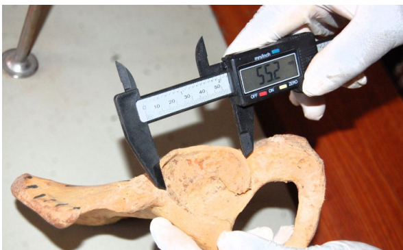
Fig 2. Measurement of the acetabular diameter

The distance from the junction where anterior iliac margin meets the periphery of the acetabulum to a point on the periphery of the Acetabulum nearest to the ischial tuberosity was measured with Electronic Vernier caliper. 17 This measurement is shown in Figure 2.