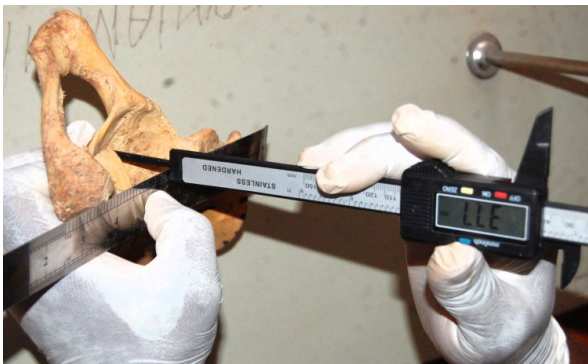
Fig. 1. Measurement of the depth of the acetabulum.

Figure 1 shows the measurement of depth of the acetabulum. The maximum vertical distance from the deepest point in the acetabular cavity (center of the acetabulum) to the horizontal plane touching the margins of the acetabular cavity. A thin metallic meter rule was kept across the margins of the acetabular cavity and the depth of the acetabulum was measured on the Electronic Vernier caliper using the depth gauge from the deepest point in the acetabulum to the ruler. 2