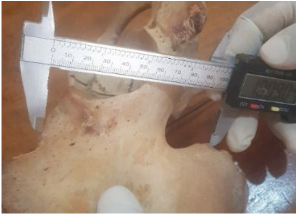
Fig. 5. Measuring the distance between the AIIS and PIIS

using student's t test. P value less than 0.05 was regarded as significant. Relationship between diameter and depth of acetabulum was assessed using Pearson correlation. A regression analysis was done to see if the depth of acetabulum can predict the diameter.