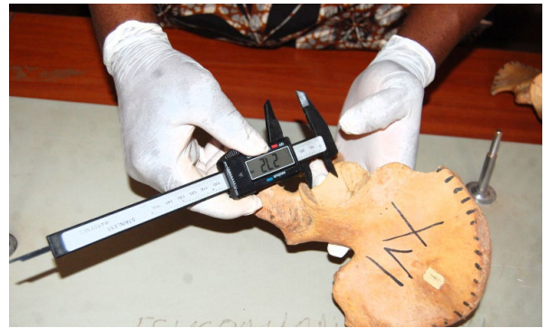
Fig 3. Measurement of the acetabular notch width.

of the acetabulum was drawn. Figure 4 shows measurement of the acetabular wall thickness. These lines divide the acetabulum into 4 quadrants; the anterosuperior, anteroinferior, posterosuperior and posteroinferior quadrants. 3 With the aid of an electronic Vernier caliper, the thickness of the acetabulum was measured at a point 2 cm from the rim of the acetabulum in each of the quadrants.