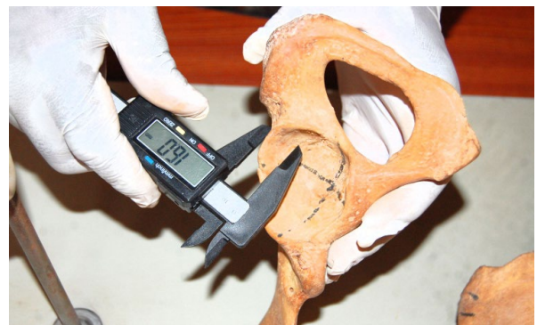
Fig. 4. Measurement of the acetabular wall thickness