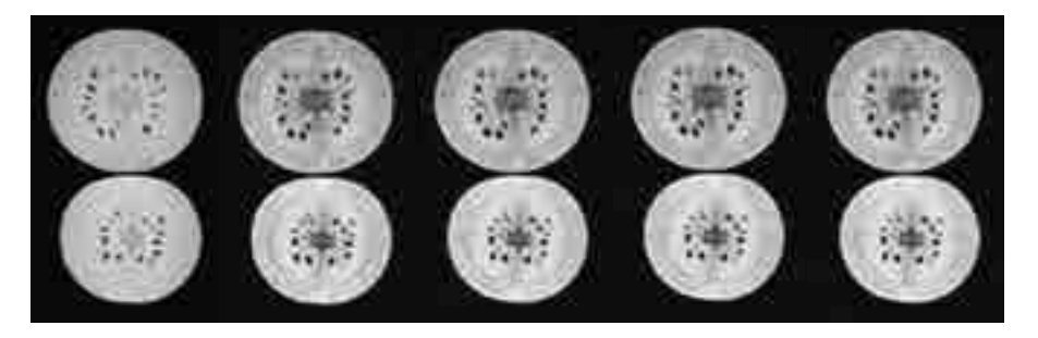
Fig. 1. Sample images of T2 FSE DICOM for TR = 12000 and TE 10, 500, 1000, 15000, 2000 ms, respectively