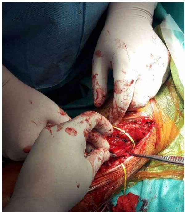
Fig. 2. Just before removing the vascular clamp to activate flow through the brachial bridge

The course of postoperative treatment without major complications. At first, the patient felt only numbness of the fingers and slight swelling of the forearm.