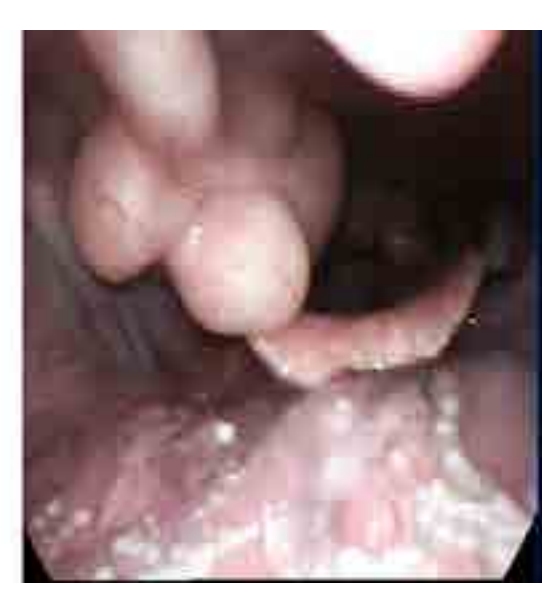
Fig. 1. Intraoral mass from the right side posterior tonsillar pillar inferiorly reaching till right laryngopharynx

On examination, a single, pale, multilobulated mass with smooth surface was seen in the oropharynx arising from the right side posterior tonsillar pillar inferiorly reaching till right laryngopharynx (Figure 1). The mass was non pulsatile, soft on palpation, and did not bleed on touch. The rest of the ENT examination was normal. A contrast enhanced MRI was done which showed a polypoidal heterogeneously enhancing mass of size 8×17×20mm