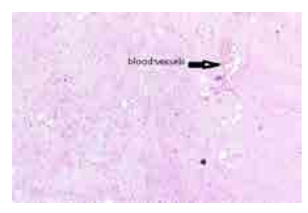
Fig. 4a. Histopathological examination of excised mass (4×)(H&E stain)