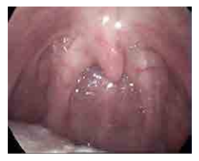
Fig. 5. Postoperative oropharynx

The patient was discharged on the third post-operative day and has remained disease free on his regular follow up for more than one year (Figure 5).