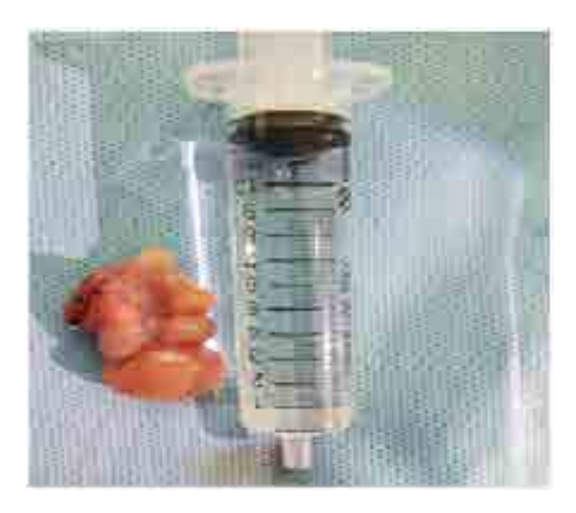
Fig. 3. Excised mass intended for histopathological examination